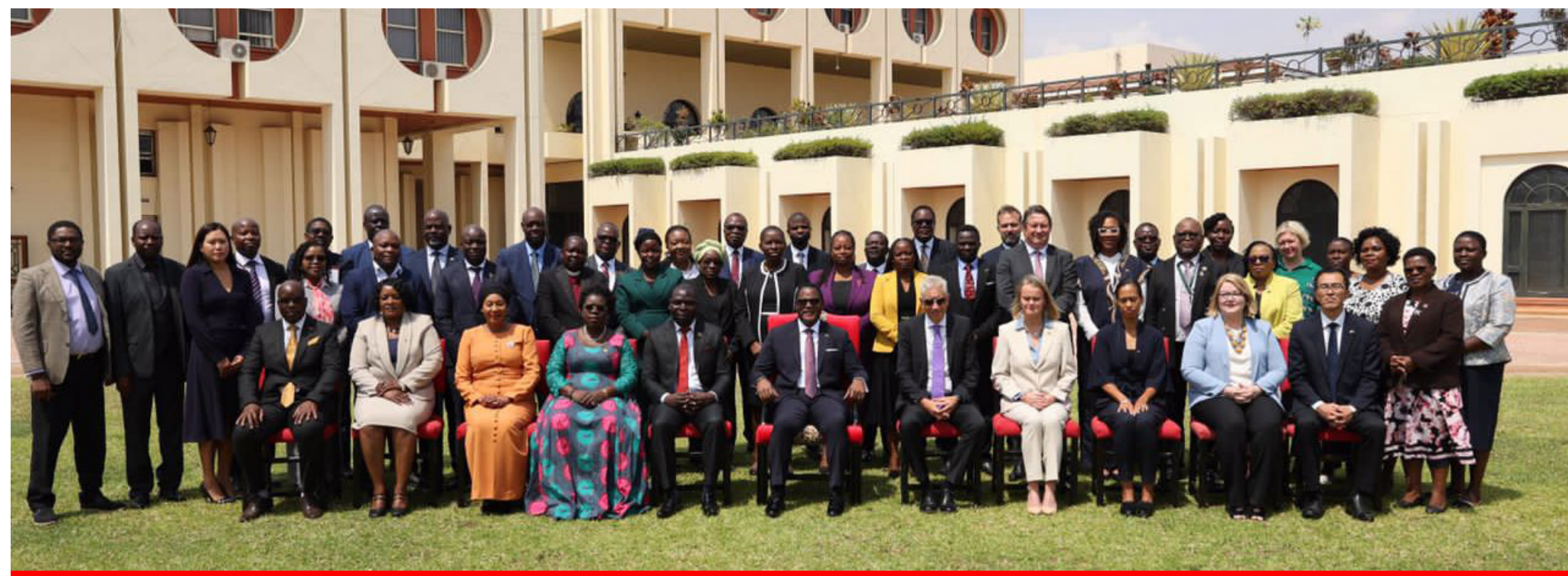
A crosss section of the Grant Launch Participants including the Minister of Finance, the Deputy Minister of Health, Secretary to the President and Cabinet, the Norwegian Ambassador, the American Embassy Charge de'affairs, the Japanese Embassy Charge de'affairs, the British High Commissioners among other distinguished delegates

MALAWI GLOBAL FUND OFFICIAL LAUNCH OF THE GRANT CYCLE 7 FOR THE PERIOD JULY 2024 TO JUNE 2027